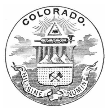
Official Colorado state seal