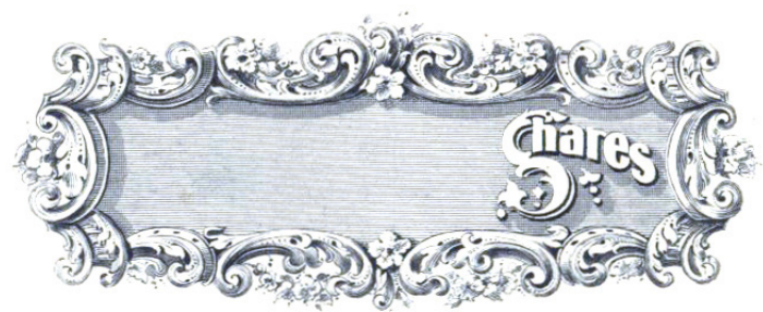
Share ornament from 1868 stock certificate of the Buffalo & Erie Rail Road Co.

matter how desirable. Some may already own certificates like them. Some won't be able to afford them. Most will try to "steal" them with lowball bids and offers. Unless certificates are sold by major auction houses, the great majority of collectors will never even learn particular certificates are for sale.