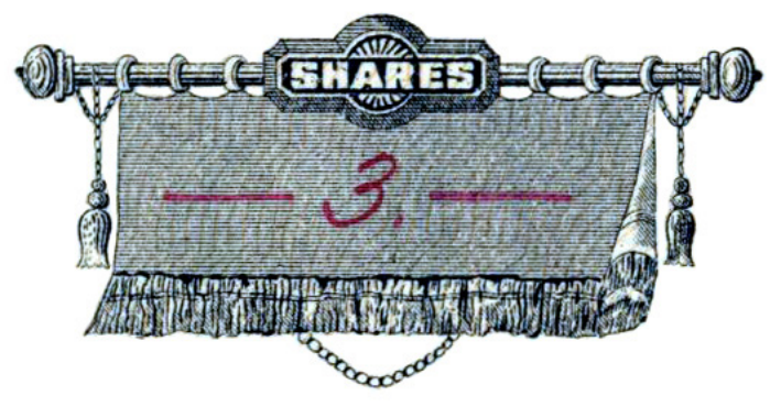
Wonderful Victorian share ornament from a 1904 stock certificate of the Baldwin & Rowland Switch & Signal Co.

Let's say collectors suggested their holdings were "worth $10,000." Estimates usually represent retail value. Collectors seldom tell their heirs to expect wholesale values when they sell. After all costs are considered, proceeds will probably end up being 50% to 70% of retail. That means heirs should probably expect to net $5,000 to $7,000 on $10,000 collections. (Add or subtract zeros as you desire.)