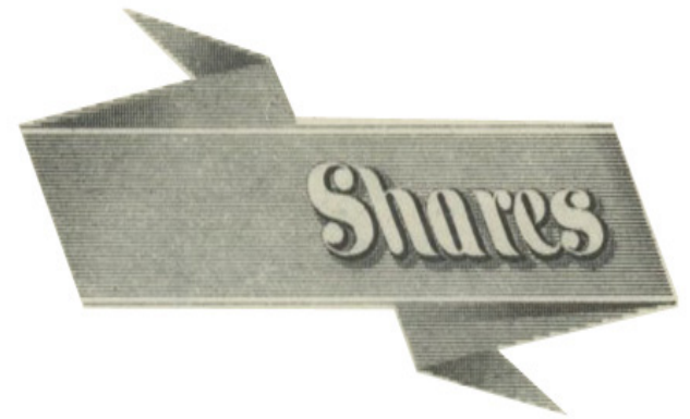
Share ornament from 1882 stock certificate from The Chesapeake Ohio & Southwestern Railroad Co.

Admittedly lacking statistics, I personally feel that most collectors, including myself, over-estimate the values of our collections. Obviously, we want to feel that we make good decisions. We want to convince ourselves that we know and appreciate our hobby and that we have knowledge of fair prices. If all that were true, we would not over-estimate so readily. Truth be told, I think the