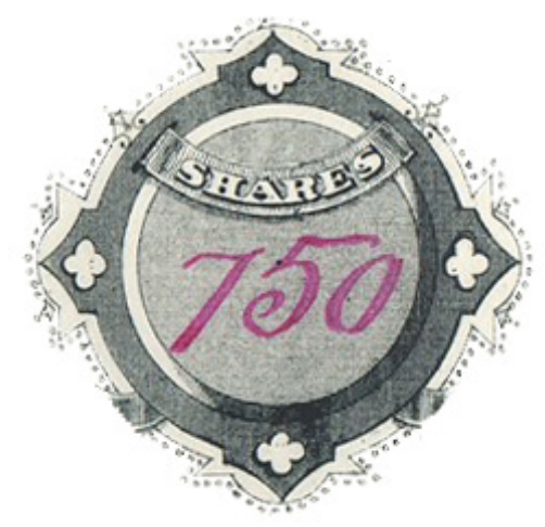
Share ornament from 1885 stock certificate from The Cleveland Indiana & St Louis Railroad Co.

examples. In other words, as many as half of our certificate varieties are as rare or rarer than 1913 V nickels!!! Yet, unless certificates carry celebrity autographs, extremely rare varieties seldom sell for more than $2000. In hobbies like coins or stamps, rarities of that magnitude routinely sell for hundreds of thousands, sometimes millions, of dollars.