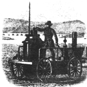
Engraving of the B&O's famous Tom Thumb locomotive. This image was used from about 1840 to the 1960s — probably the longest-running image used on American certificates.

From your viewpoint, though, the most obvious changes in the next edition will, of course, be the addition of new certificates. However, you will also see that I have completely revamped railroad names by adding key words such as "RR," "Ry," "Co," "Corp", and so forth.