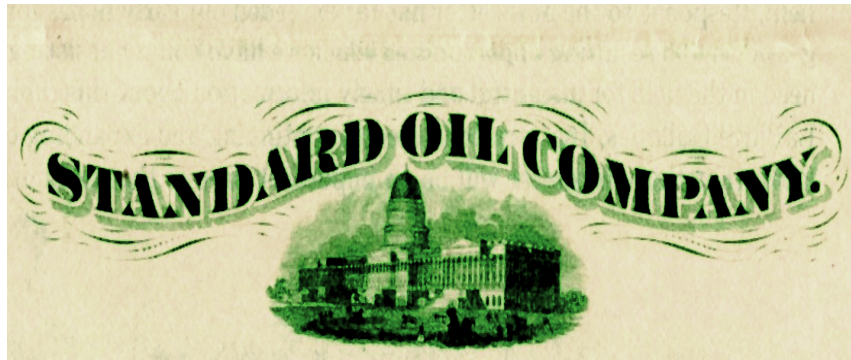
STANDARD OIL COMPANY

Company histories are another possibility for book purchases. Locating a company history is almost solely dependent upon the size of the company-the larger the company, the greater the likelihood that a history (or histories) has been written about it. Company history information can be (and usually is) very difficult to secure. Besides purchasing a company history when available, the Moody Company's series of manuals, e.g., Industrial, Public Utility, etc., frequently have a brief bit of history with each company entry. It is suggested that stock and bond collectors check their local public library to determine the availability of any Moody's manuals, especially older editions. If not available locally, ask your public librarian to request a photocopy of company information/history from one of your state's larger public universities. Usually, larger universities will hold long runs of the various Moody's manuals as far back as their original date of publication.